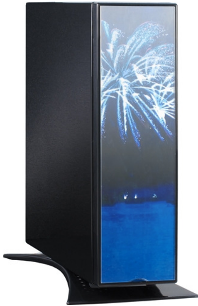
Picture can be changed against own picture