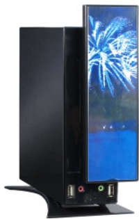
Front panel opened